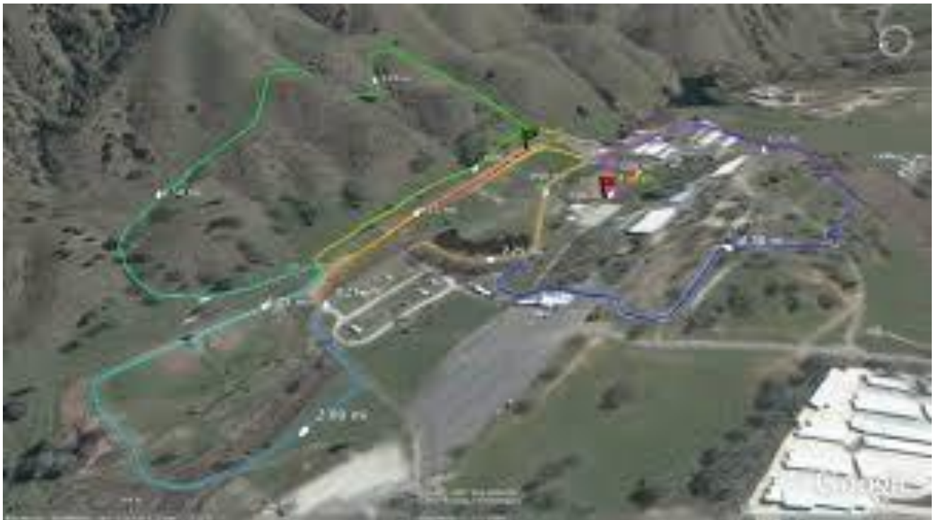
Cross Country Course

RESTROOMS - There are 4 outside restroom buildings. Two have showers. In addition, Mark Twain Hall and the Frogeteria have restroom facilities.